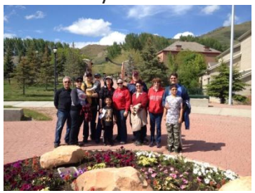
This living history park gives visitors a taste of how the earliest pioneers led their daily lives.

Rain quickly gave way to blue skies as the Arcadians gathered at This is The Place Heritage Village for our May event.