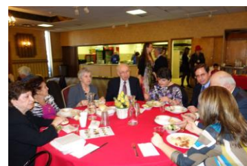
Enjoying the Makaronada